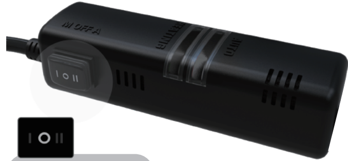
Power Stay Off