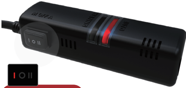
Power Stay On